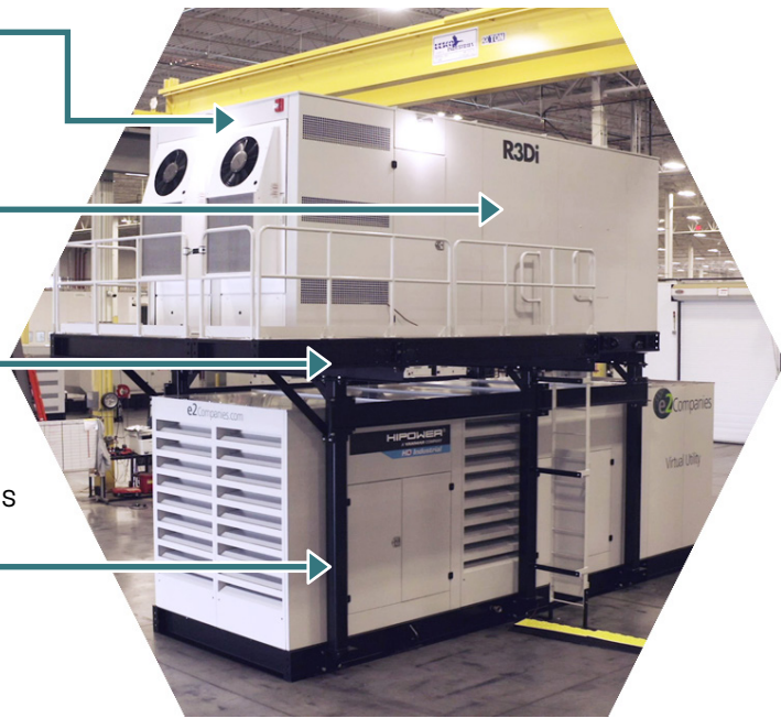
Figure 1: Stacked R3Di® System Design